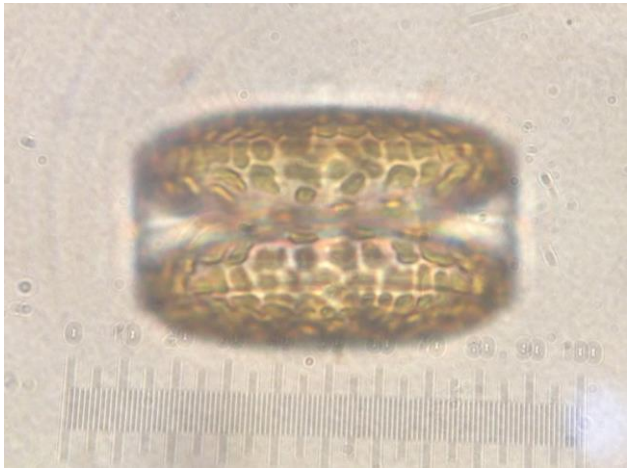
Girdle view of a living centric diatom from a subculture.